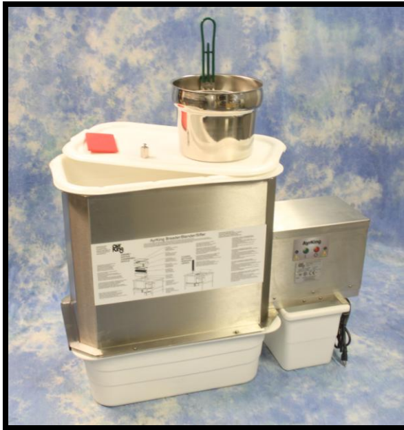
Photo of BBS-U-RH

AyrKing offers an automatic Blender/Sifter machine for hand breading operations. Rotary brush sifter operates without detrimental vibration or agitation. Spirally configured nylon bristles form an auger to eject unwanted dough balls to a waste container. Ingredients are fully blended as brush tumbles breading media before it exits through sifter screen. Unique process prevents dough ball grinding, eliminates usual sifting noise, & blends ingredients as it ejects waste. The sifter machine is mountable to any customized s/s worktable. Sifter orientation is field adaptable as protruding motor/control compartment is reversible from right to left side & pan slide stops are reversible.