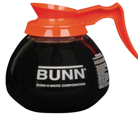
DECANTER, GLASS-ORN 12C 24/CS