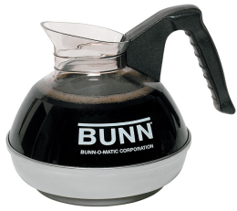
EASY POUR,(BLK) 1/CS