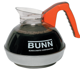
EASY POUR,(ORN) 6/CS