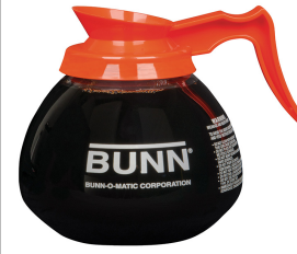
DECANTER, GLASS-ORN 12C 3/CS