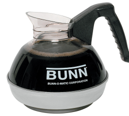
EASY POUR,(BLK) 6/CS