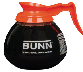
DECANTER, GLASS-ORN 12 CUP 1PK