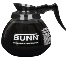
DECANTER, GLASS-BLK 12C 3/CS