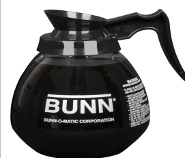
DECANTER, GLASS-BLK 12C 24/CS