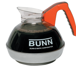
EASY POUR,(ORN) 2/CS