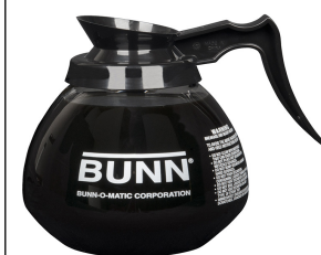
DECANTER, GLASS-BLK 12CUP 1PK