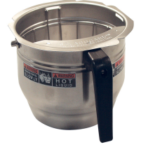
FUNNEL AY,W/DECAL GRT "C"7.12