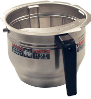
FUNNEL AY,W/DECAL GRT "C"7.62