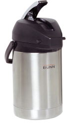
AIRPOT, 2.5L SST LA SINGLE PK