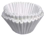
FILTERS,REGULAR1M 500/2 50/CL