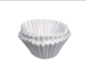
FILTERS,C GOURMET 500/2 50/CL