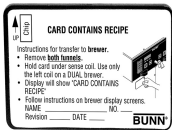
CARD ASSY,RECIPE TRANSFER(BRW)