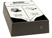
BREWWISE RECIPE WRITER