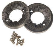
BURR SET KIT, NEW