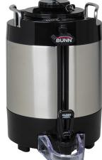
TF SERVER, 1.5G/5.7L MECH NOBASE