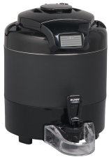
TF SERVER, DSG2 1G BLK NOBASE