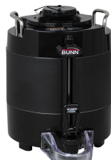
TF SERVER, 1G/3.8L MECH BLK NOBASE