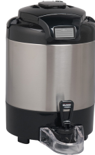
TF SERVER, DSG2 1.5G SST NOBAS