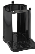
STAND ASSY, TF SERVER