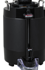
TF SERVER, 1.5G/5.7L MECH BLK NOBASE