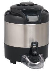
TF SERVER, DSG2 1G SST NOBASE