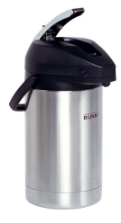
AIRPOT, 3.0L SST LA SINGLE PK