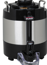
TF SERVER, 1G/3.8L MECH NOBASE