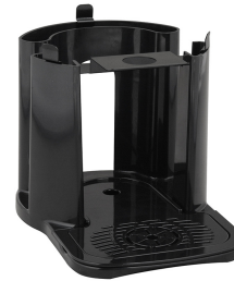
STAND ASSY, TF SERVER