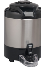
TF SERVER, DSG2 1.5G SST CD NOBAS