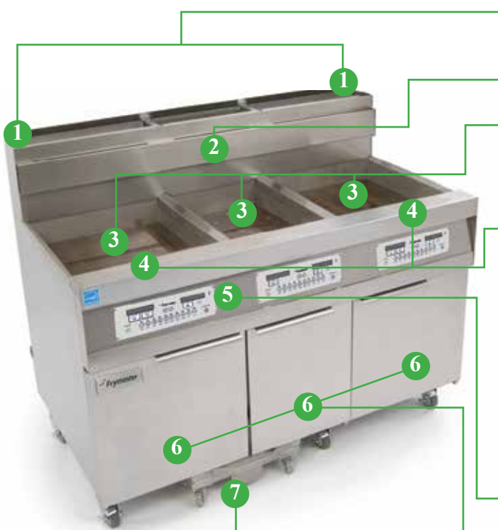
Model shown: 11814/HD50G/11814