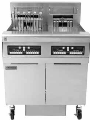
FPRE217C Shown with optional CM3.5 controllers