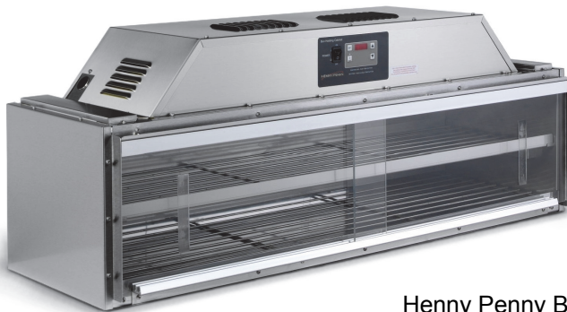
BW 4 bun warmer with 2 shelves, 4 trays across

Henny Penny Bun warmers help maintain higher bun quality and texture while improving the efficiency of sandwich production.