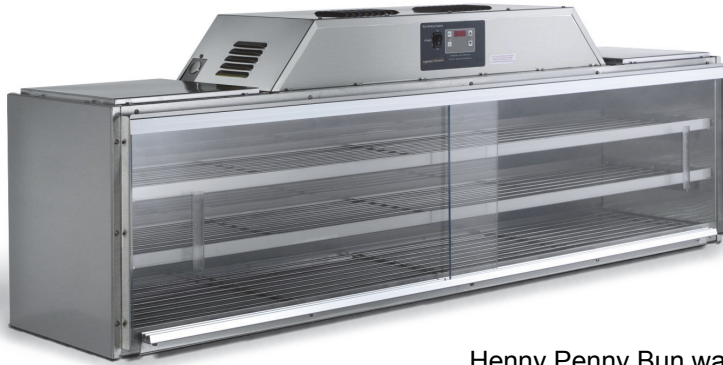
BW 6 bun warmer with 3 shelves, 6 trays across

Henny Penny Bun warmers help maintain higher bun quality and texture while improving the efficiency of sandwich production.