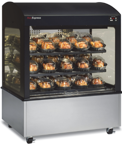
EPC 400 Express profit center short profile 4-ft unit on available casters

Henny Penny express profit centers present an excellent solution for retailers seeking to expand hot food impulse sales and cross-merchandising opportunities.