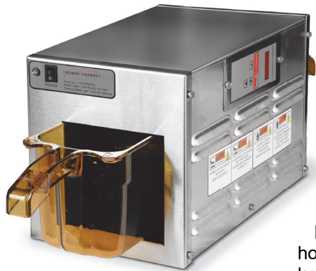
MPC 21L dual access modular multi-purpose holding cabinet

Henny Penny multi-purpose holding cabinets are ideal for keeping small quantities of hot menu items safe, appetizing and ready for immediate serving or packing.