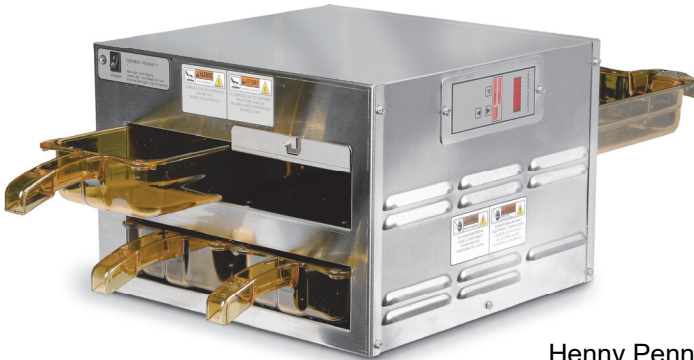
MPC 222 dual access modular multi-purpose holding cabinet

Henny Penny multi-purpose holding cabinets are ideal for keeping small quantities of hot menu items safe, appetizing and ready for immediate serving or packing.