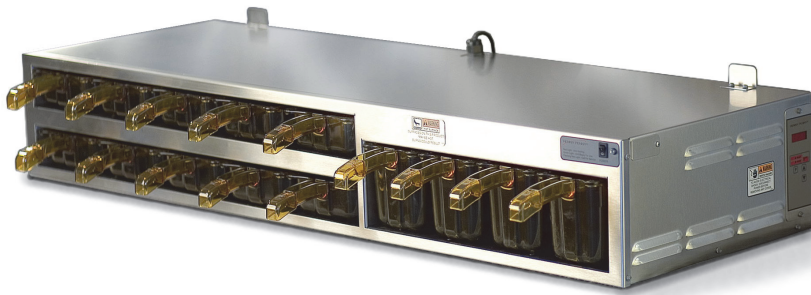
MPC 554 multi-drawer, multi-purpose holding cabinet

Henny Penny multi-purpose holding cabinets are ideal for keeping small quantities of hot menu items safe, appetizing and ready for immediate serving or packing.