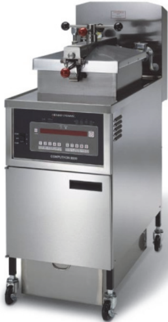
PFE 500 electric pressure fryer with Computron™ 8000 control

Henny Penny first introduced commercial pressure frying to the foodservice industry more than 50 years ago. Frying under pressure enables lower cooking temperatures for longer oil life, and faster cooking times to meet peak demand. Pressure also seals in food's natural juices and reduces the amount of oil absorbed into product.