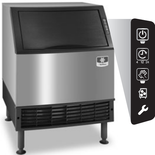
U-310 Undercounter Ice Machine