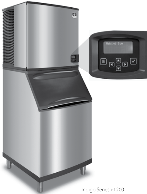
Indigo Series i-1200 Ice Machine on B-570 Bin

Designed for operators who know that ice is critical to their business, the Indigo™ Series ice machine's preventative diagnostics continually monitor itself for reliable ice production. Improvements in cleanability and programmability make your ice machine easy to own and less expensive to operate.