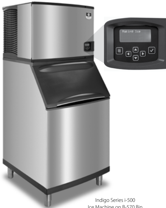
Indigo Series i-500 Ice Machine on B-570 Bin

Designed for operators who know that ice is critical to their business, the Indigo™ Series ice machine's preventative diagnostics continually monitor itself for reliable ice production. Improvements in cleanability and programmability make your ice machine easy to own and less expensive to operate.