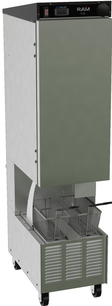
Fryer Baskets Sold Separately