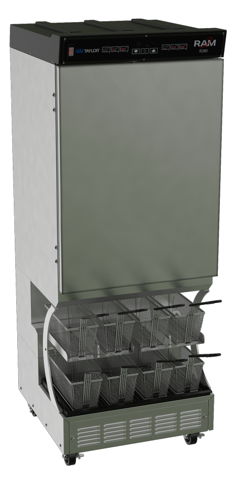
Fryer Baskets Sold Separately