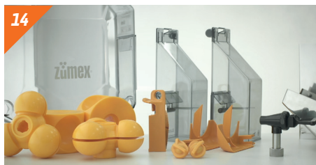
14 Clean parts.