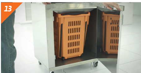
13 Empty waste trolley.