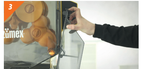
3 Take out the cover sides. Turn the lock / Extract the peel guides.