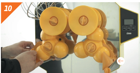
10 Pull off the peel ejectors.