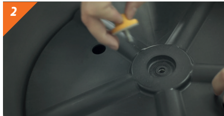
2 Drain&Clean. Drain system that makes easier to clean the feeder.