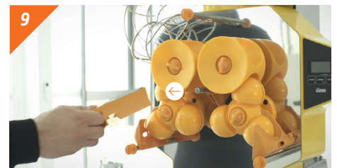
9 Extract the knife by pulling it towards you. CAUTION! The blade is very sharp, be careful not to cut yourself.