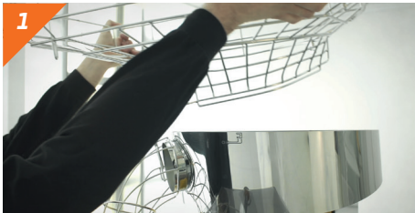
1 Take off the feeder basket.

Caution! For a correct cleaning process please follow the instructions below. Make sure machine is unplugged from electrical current.