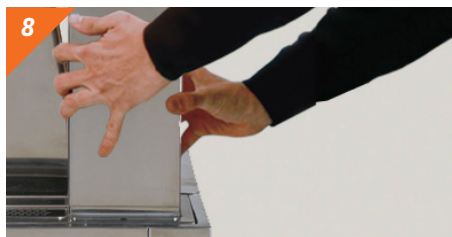
8 Take out the inox peel bucket.