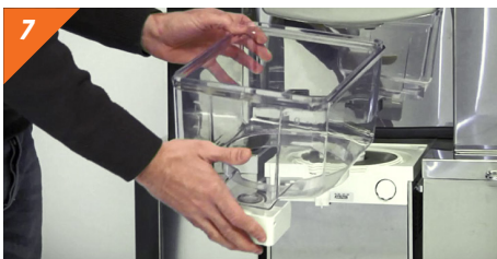
7 Take off the juice deposit.