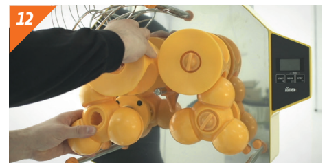
12 Take off the pressing units in pairs.