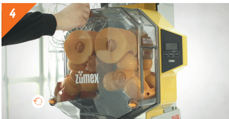
4 Take off front cover with the fixed Click&Clean lugs.