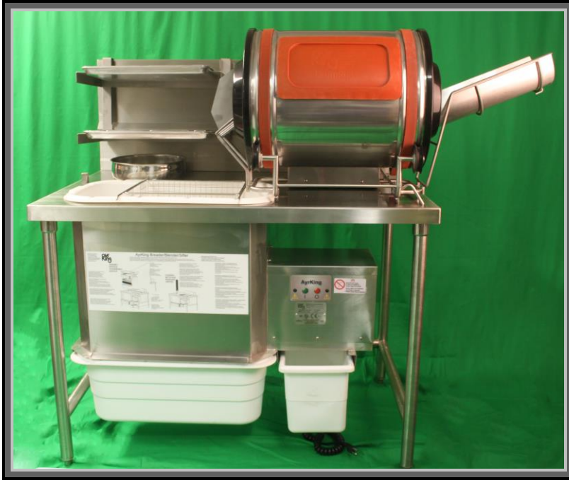
PICTURE IS BBS-U-4830-BPC TABLE W/ DRUMROLL

The company you trust to care for your breading, offers an automated breader that maintains high standards while simplifying your operations & training. DrumRoll mimics your current batch breading processes, only better! The product you serve is ultra-consistent, just like your customers expect. Plus breading and oil savings add up quickly with the DrumRoll. It integrates seamlessly on your AyrKing single sifter table. No need to rearrange your kitchen or add a worktable.