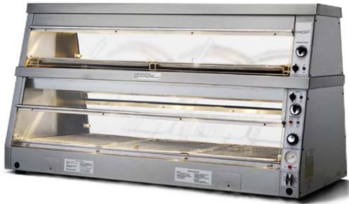
Two-tier display counter warmer, model HCW-5 with flip-up pass-through doors and lower-tier moist heat operation.

MODEL HCW-5 two tier, 5-pan HCW-8 two tier, 8-pan