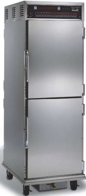
HHC 990 SmartHold full-size heated holding cabinet with automatic humidity control

Henny Penny SmartHold humidified holding cabinets create and maintain ideal conditions for holding a wide variety of hot foods over extended periods of time prior to serving.