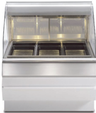
HMR 103 3-well full-serve heated merchandiser

Henny Penny HMR heated merchandisers are designed to provide operators with the ultimate in flexibility and performance for hot food display and service.