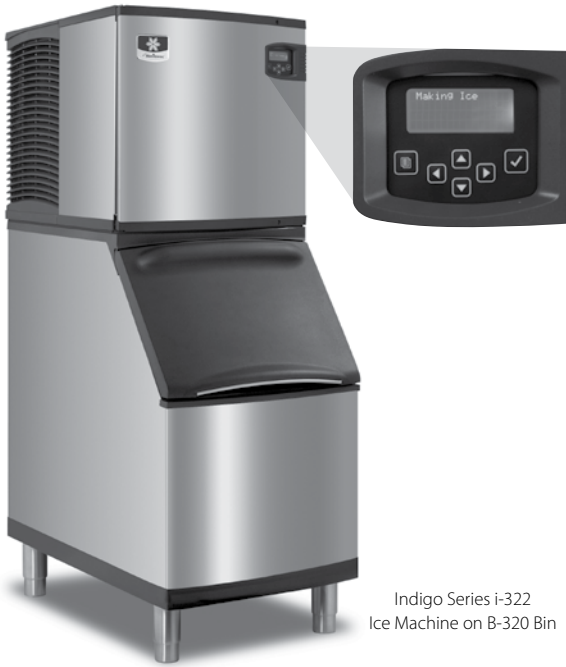
Indigo Series i-322 Ice Machine on B-320 Bin

Designed for operators who know that ice is critical to their business, the Indigo™ Series ice machine's preventative diagnostics continually monitor itself for reliable ice production. Improvements in cleanability and programmability make your ice machine easy to own and less expensive to operate.