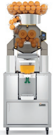
Speed Pro Cooler Podium