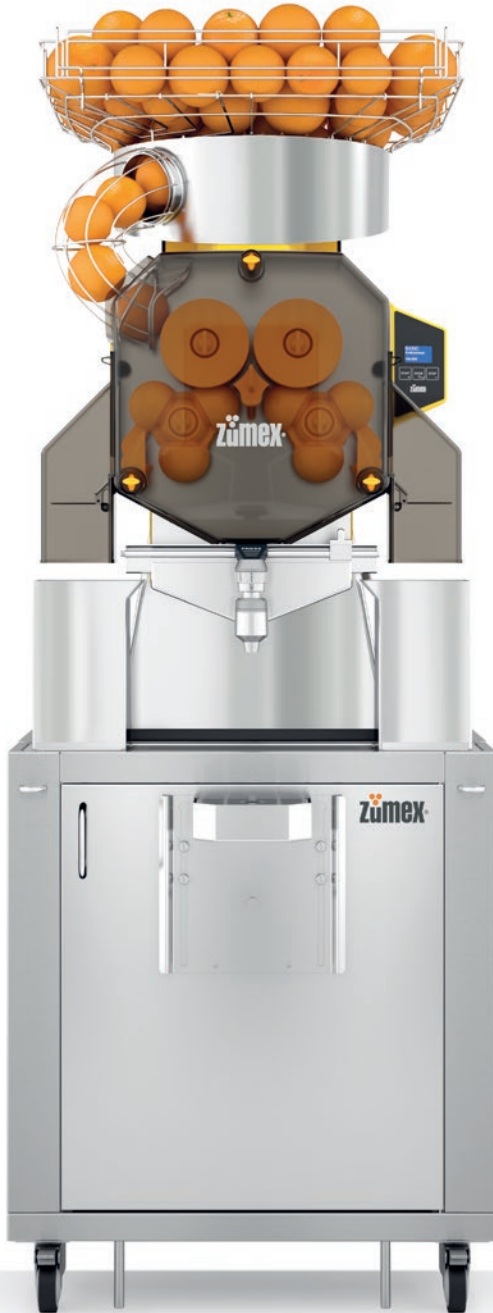
Speed Pro Self Service Podium