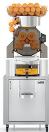
Speed Pro Tank Podium

Offer the best freshly squeezed juice to your customers and bring them a Life Essence experience.